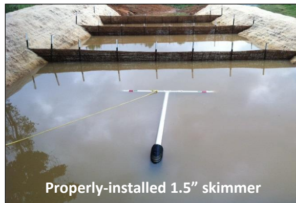
Properly-installed 1.5" skimmer

Skimmer Head Doesn't Float Flat: If the skimmer head isn't floating evenly on the surface of the water, (a) pull skimmer head up from basin with attached rope and check to make sure both water chambers are completely filled, and (b) adjust head at threaded point between skimmer head and 6' barrel to make level and return to basin. If certain that water chambers are both completely filled, instead of pulling skimmer out of basin, you may also loosen one of the metal fasteners on the Flexible Coupling, twist the Barrel until the skimmer floats evenly, and then retighten the metal fastener.